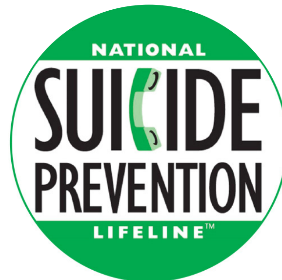
National Suicide Prevention Lifeline