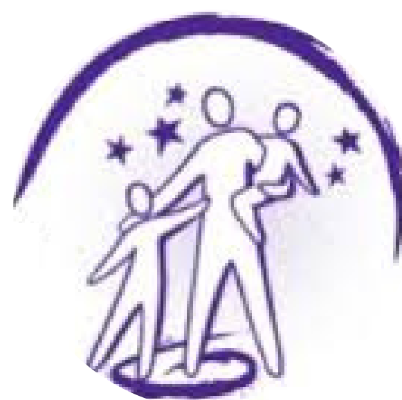
Regional Centers for Children and Youth with Special Health Care Needs (CYSHCN)