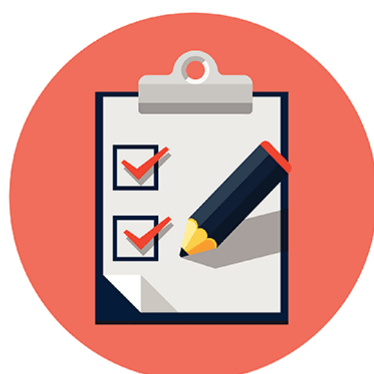
Youth Mental Health Crisis Plan